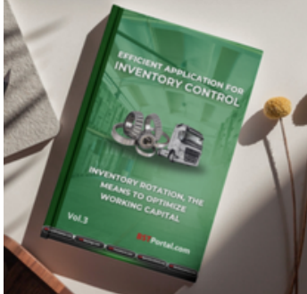
E-Book Vol. 3 Inventory Rotation, The Means to Optimize Working Capital