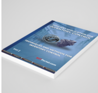
E-Book Vol. 2 Techniques And Methods for Inventory Control