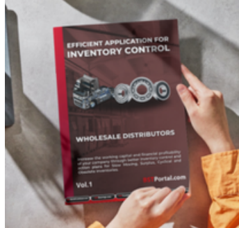
E-Book Vol. 1 Wholesale Distributors